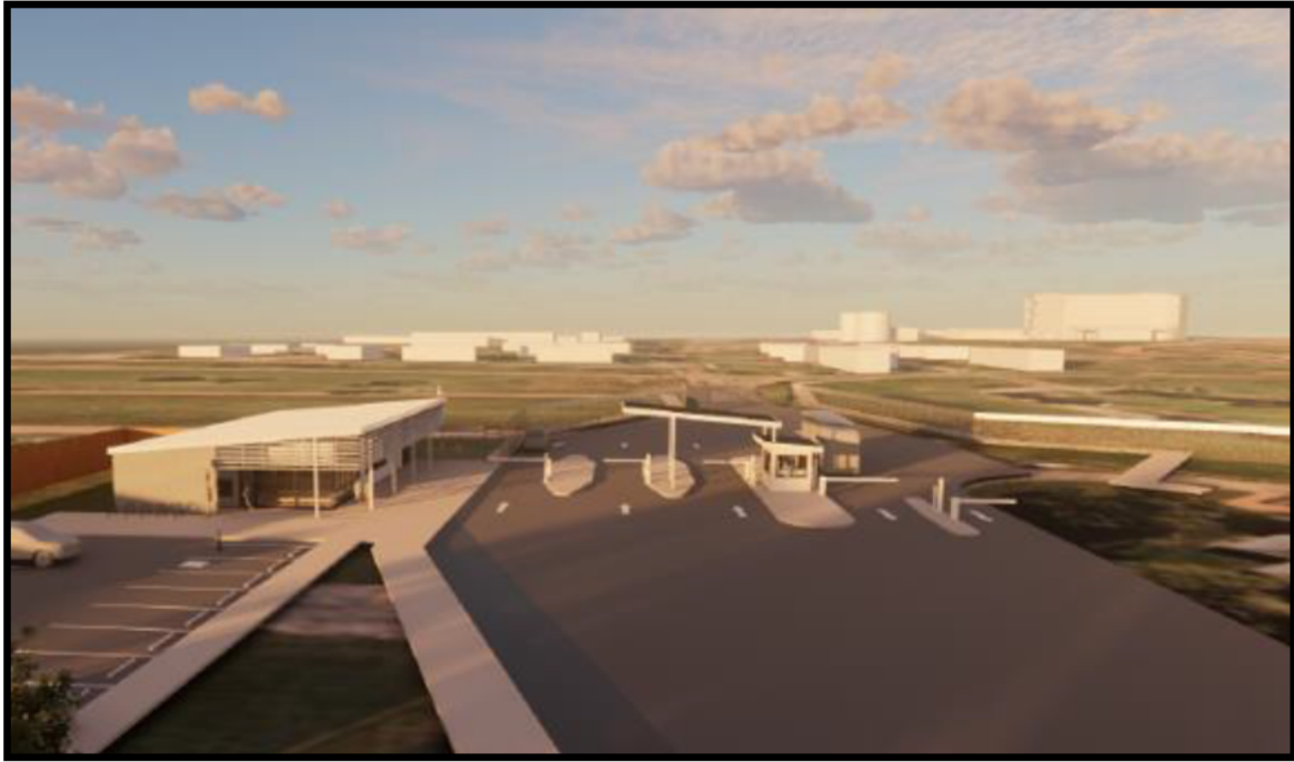
Figure 1: Main Entry Precinct