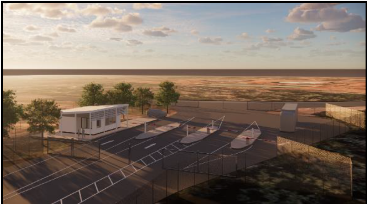
Figure 2: Heavy Vehicle Entry Precinct